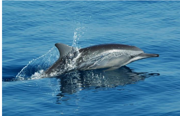
Spinner Dolphin

flung islands, enjoying the scenery, cetaceans and birdlife. Although there has been relatively little cetacean research in the Solomon Islands, it has highlighted the splendid diversity and abundance of whale and dolphin species in and around the archipelago. Nevertheless, there is much still to be discovered. Our inaugural cruise in 2018 enjoyed sightings of 16 cetacean species, including Omura's Whale, a little-known baleen whale that was only described in 2003. Other cetaceans that we may see include: Spinner Dolphin, Spotted Dolphin, Striped Dolphin, Risso's Dolphin, Bottlenose Dolphin, Indo-Pacific Bottlenose Dolphin, Fraser's Dolphin, Rough-toothed Dolphin, Pilot Whale, False Killer Whale, Melon-headed Whale, Cuvier's Beaked Whale, Longman's Beaked Whale, Blainville's Beaked Whale, Dwarf Sperm Whale, Sperm Whale and Blue Whale. We will undoubtedly see plenty of other marine life too, including both flying fish and tuna which are abundant and should be spotted regularly, as may turtles.