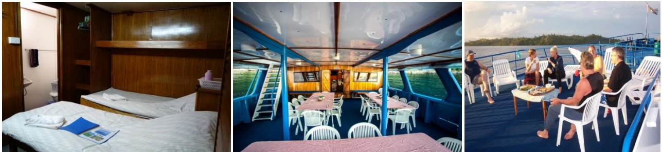
From left: guest cabin, covered deck area, sun deck