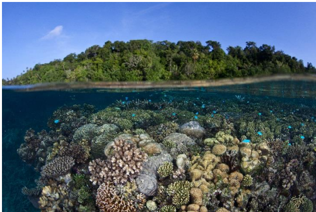
Coral Reef, Marovo Lagoon

Whilst we will enjoy plenty of time at sea each day, searching for and enjoying cetacean sightings, we will also make time for visits ashore to enjoy birds and other wildlife, and to visit traditional